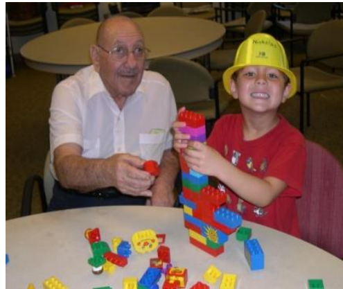
New Day's Intergenerational Program spreads smiles!