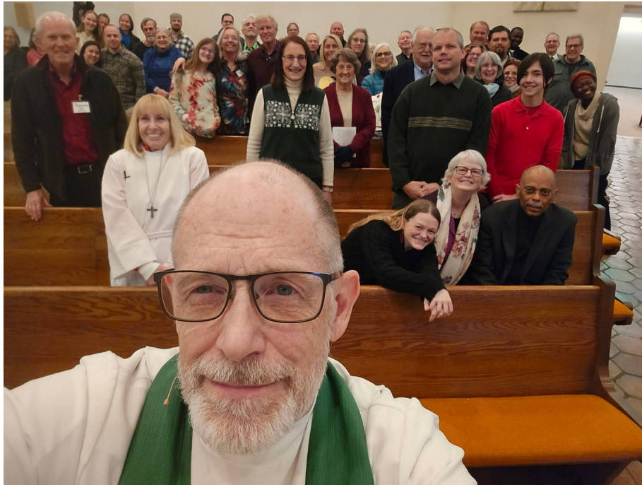
Traditional and Contemporary Service congregants

Whether in the room or on the screen, we're grateful for you and your continued faithfulness.